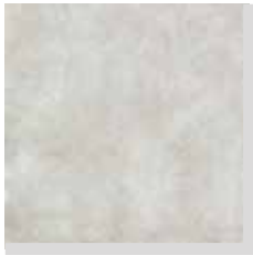
Cool White (H001)