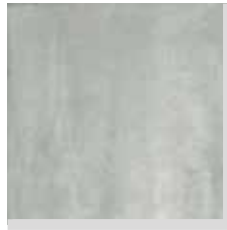
Cool Grey (H013)